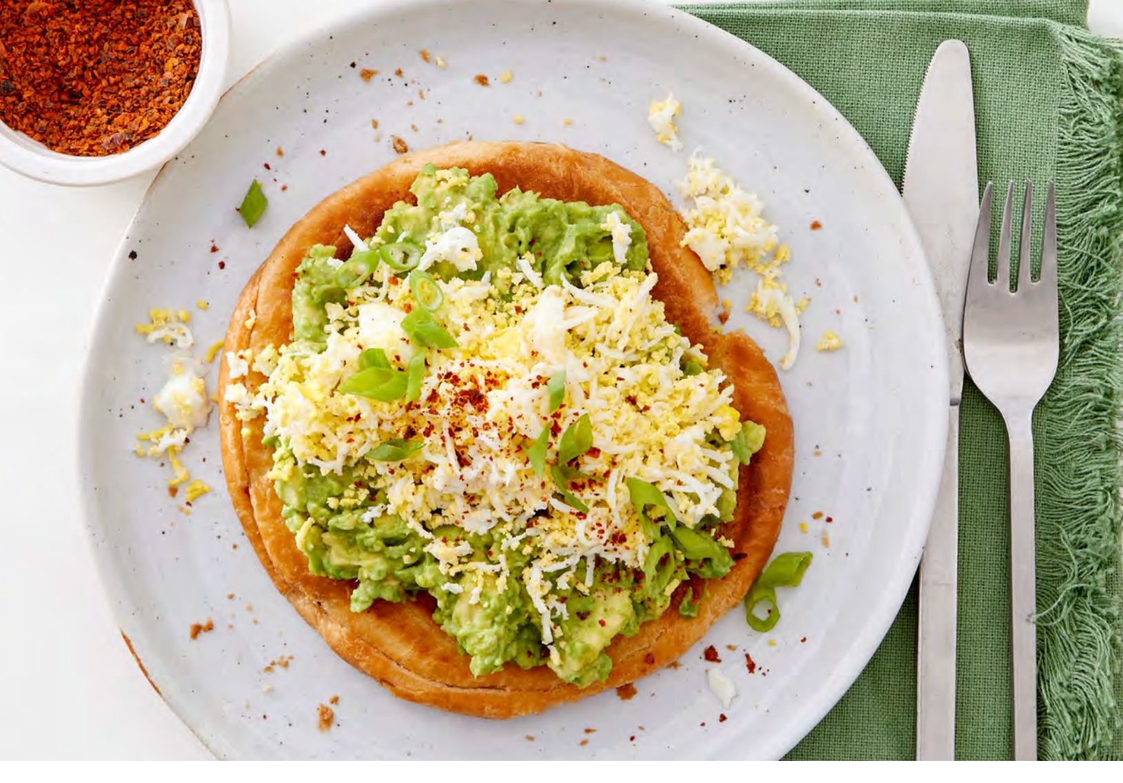
↑ Mashed Avocado Flat Croissants, Page 27