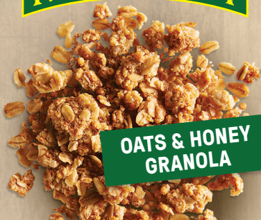
OATS & HONEY GRANOLA