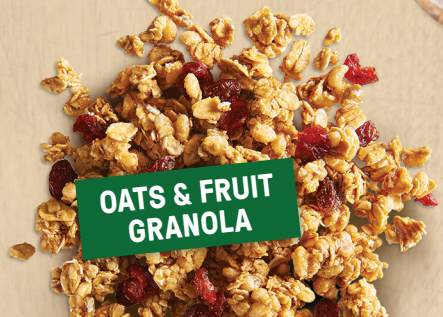
OATS & FRUIT GRANOLA