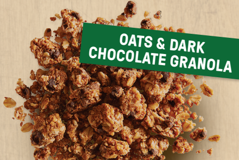
OATS & DARK CHOCOLATE GRANOLA